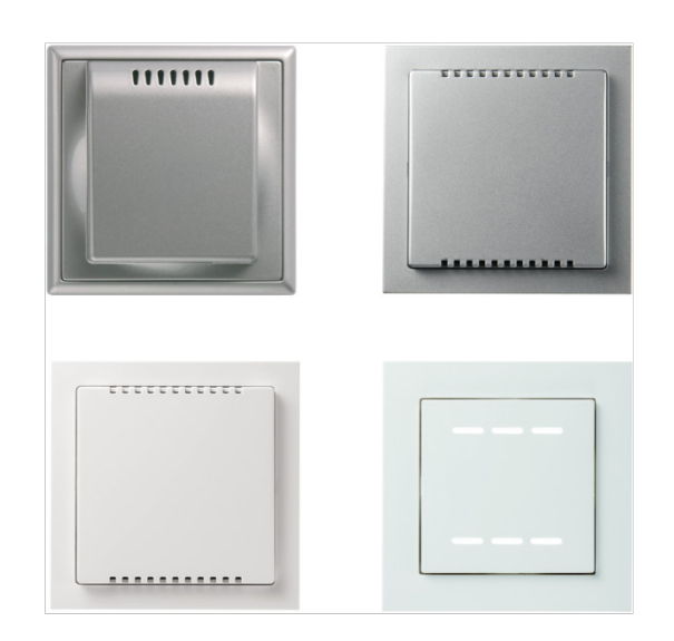
Illustration similar, variant depending on the switch range

Subject to technical alteration Issue date: 3/25/2021 • A110