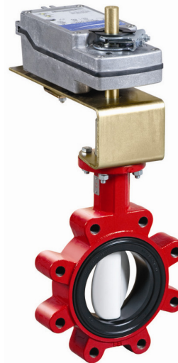
Two-Way Valve with M9000 Series Spring-Return Electric Actuator (without Weather Shield)

If the VF Series Butterfly Valve fails to operate within its specifications, refer to the VF Series Standard-Pressure, Standard-Temperature Butterfly Valves Product Bulletin (LIT-977205P) for a list of repair parts available.