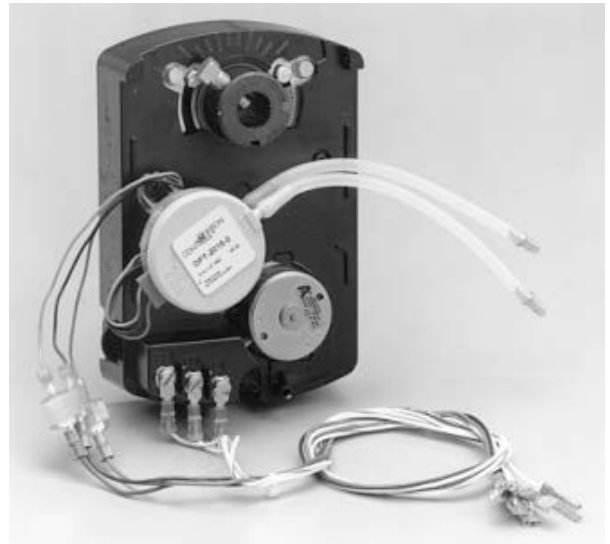
Figure 1: M9106-AGS-2N02 Non-spring Return Actuator

The M9106-AGS-2N02 Actuator/Transmitter combines an M9106-AGA-2N02 with a prewired DPT-2015 Differential Pressure Transmitter that has a 0 to 1.5 in. W.C. (0 to 374 Pa) differential pressure range.