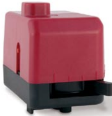
Spring Return Normally Open/Normally Closed Floating/Proportional Actuator