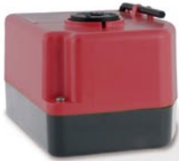
Spring Return Normally Open/Normally Closed Two-Position Actuator