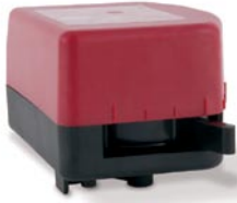
Non-Spring Return Floating/Proportional Actuator